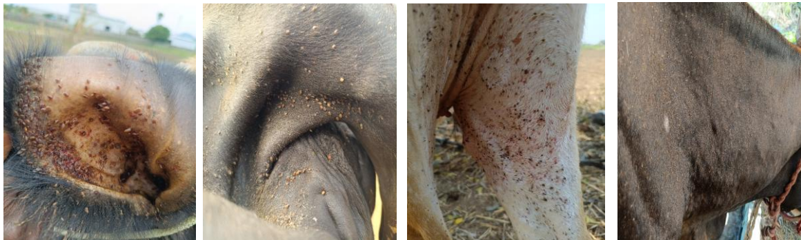
Tick infestation in cattle

Tick infestation in cattle has been recognized as one of the challenging and perennial problem in cattle, causing significant economic losses to poor farming communities in terms of production losses, mortality in severe cases and cost of treatment. The cattle ticks Rhipicephalus (Boophilus) microplus and R(B) annulatus ticks commonly infest cattle. Ticks are cosmopolitan in distribution, but the magnitude of tick infestation is naturally high in tropical and subtropical regions with warm and humid climates, which are suitable for breeding and survival of various tick stages. Economic losses due to tick infestation are classified as direct and indirect. Direct losses include blood loss, tick toxicosis, tick paralysis, tick worry, damage to hides and udders. Indirect losses occur through transmission of many haemoprotozoan diseases such as babesiosis, theileriosis and anaplasmosis, and predisposition to secondary infections such as screw worm myiasis and dermatophytosis, and the expenses incurred for tick control.