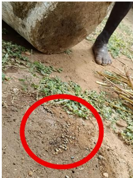
Engorged ticks found under the water trough indicated by red circle

Generally, ticks prefer moist environmental conditions for oviposition. If we generally take a look around the animal house, the cracks and crevices, stones, under feed and water troughs, water pipes are the most favourable conditions for the ticks to lay eggs. The pillars are the favourable environment for the seed ticks to climb.