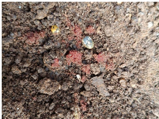
Cattle ticks in oviposition